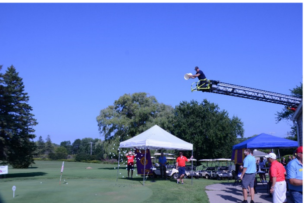
Grafton Fire Department Ball Drop